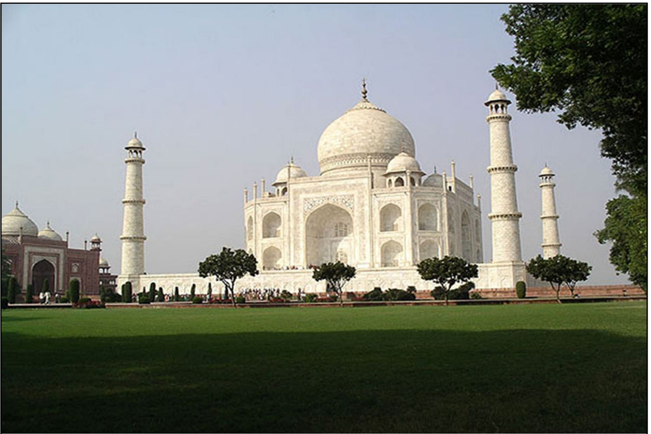
TAJ MAHAL - AGRA