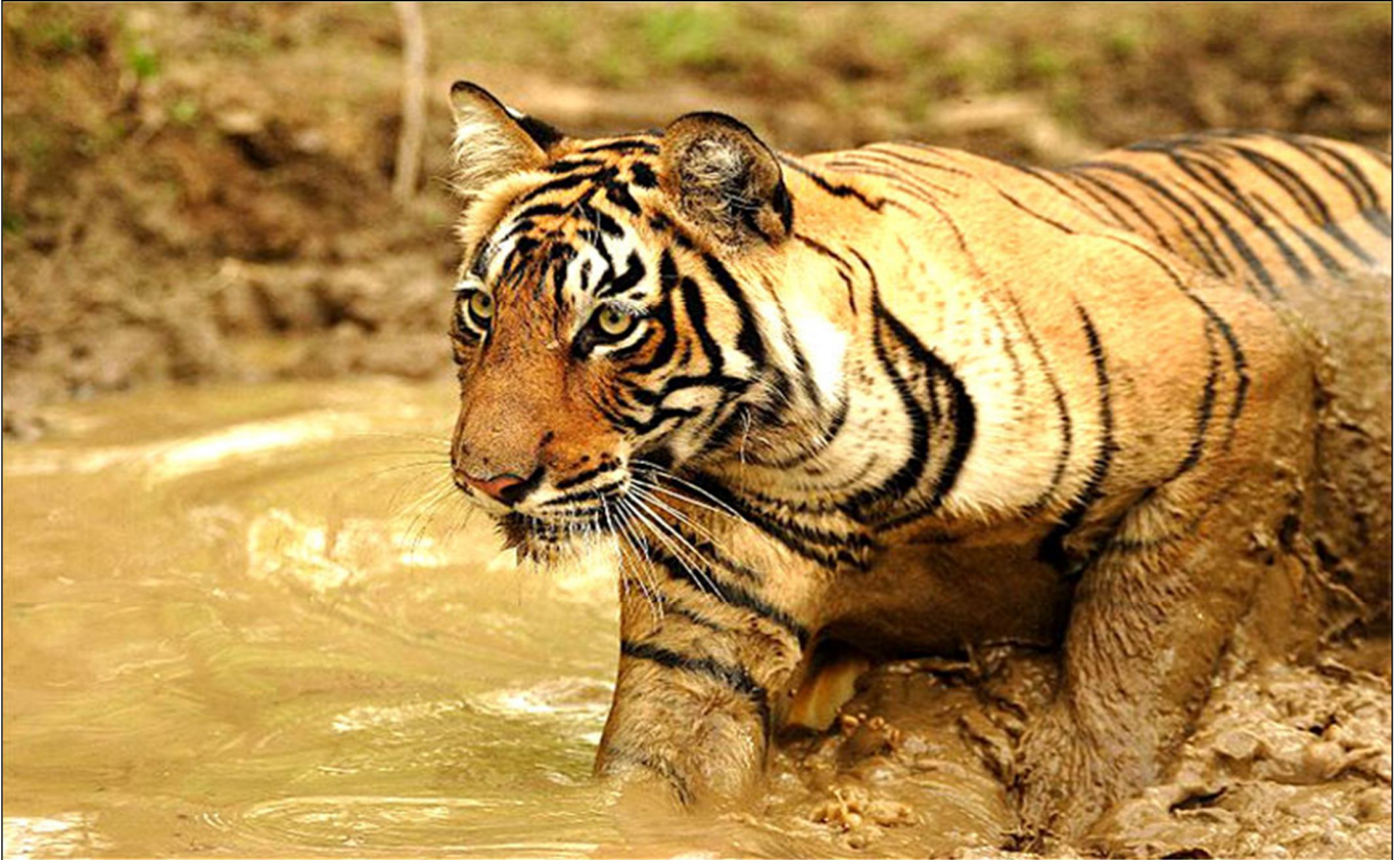
HUNTING TIGER - RANTHAMBHORE