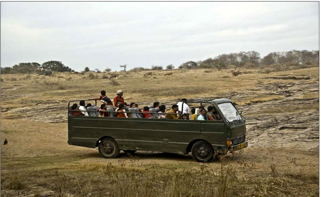
CANTER SAFARI - RANTHAMBHORE

Enjoy morning and afternoon safaris in the park. It is a dry deciduous forest replete with several lakes, rivulets and a magnificent ancient fort overlooking the park. The wildlife that one can see here are a large variety of birds, including an impressive number of waterfowl and birds of prey. The water bodies are home to marsh muggers, turtles and pythons. The park also has